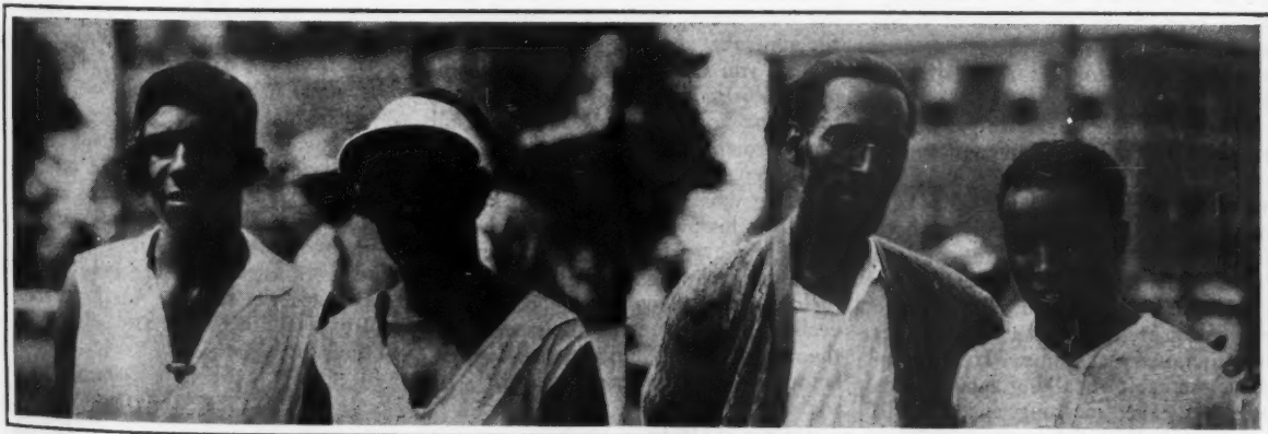
Tennis Champions, page 165

☐ Prime Minister Hertzog has introduced a bill to give white women suffrage throughout South Africa. This for the first time raises discrimination in the franchise requirements of Cape Province. There the present requirements for voting are $250 a year in wages or property of equal value; there is no discrimination between white and colored.